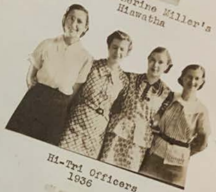
Hi-Tri Officers 1936